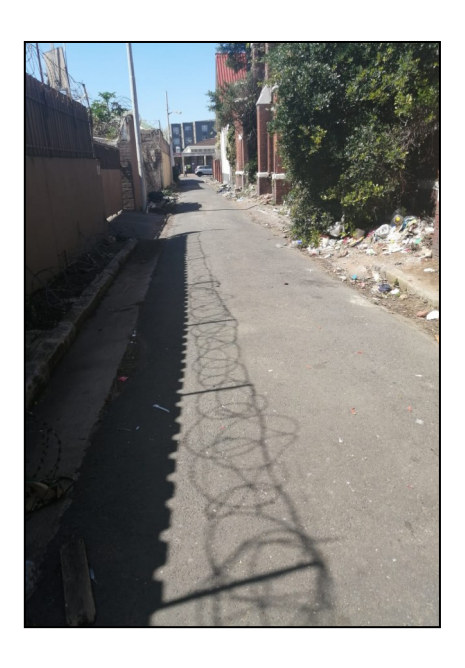
Because sex work remains criminalised for more than five decades, the working conditions in which sex workers find themselves in remains not only a danger to them, but a danger to society at large. The current norms which sex workers are resorting to need to be met with decriminalisation, to afford safe working spaces. It is in such horrendous 'working spaces' and worse that some sex workers find themselves having to render services and live in. No person deserves to find themselves calling this home nor their workplace.